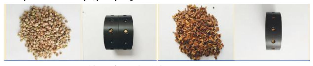
Spinach, crown daisy can sow 1-2 pcs, plant spacing 5-13cm